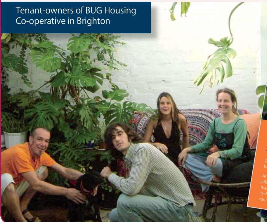
Tenant-owners of BUG Housing Co-operative in Brighton