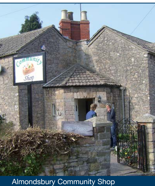
Almondsbury Community Shop