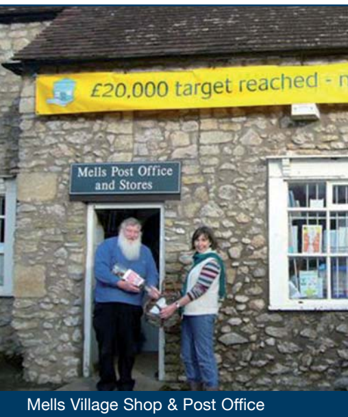
Mells Village Shop & Post Office