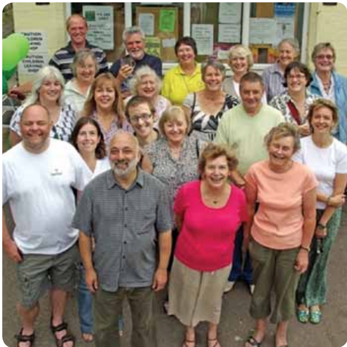
Whitbourne Village Community Shop

2012 was the final year of the Village CORE Programme and rural communities continued to benefit from its support. The programme was initially launched in 2006 in partnership with the Plunkett Foundation and the Esmee Fairburn Foundation. It was scheduled to end in 2009 but was extended for a further three years. With the help of ICOF Community Capital Ltd by the end of 2012 over £2m had been lent to over 100 community owned shops.