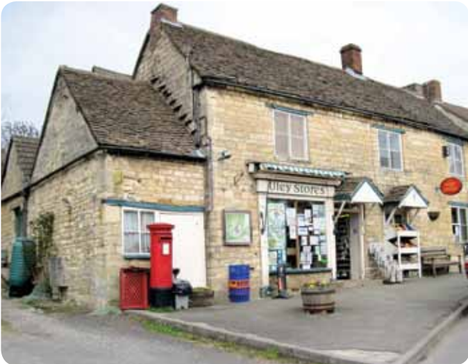
Uley Community Stores

With the support of the shareholders at the 2012 AGM it was decided to extend our service to meet the demand from the wider co-operative sector, for example: housing co-operatives, multi-stakeholder co-operatives and community co-operatives. All of which will be common ownership enterprises but where ownership is extended to tenants, customers and the community. However our existing focus on workers co-operatives continued to take preference in 2012.