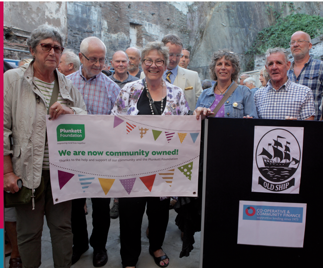
The Old Ship Inn, Cornwall